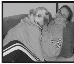
Tonka recovering from surgery

Do you want to know what really hits me in the pit of my stomach? I wonder – who will take Tonka? He is such a big, handsome Pit Bull. I once nursed him back to health after he suffered a ruptured spleen from a benign mass. After surgery, it was the first time Tonka had ever been in a home. The big guy was afraid of the TV set and even the rocking chair, but he loved to sit by me and put his head in my lap. I have never found a dog who could cuddle like Tonka. You see, I love Tonka, so I wonder, if we have to close down, who will take Tonka?